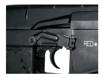
SEMI: With one trigger pull one BB is fired