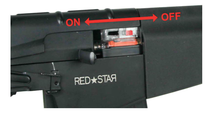
Step 2. To add more hop you will slide the bar back and to turn off the hop up unit or to lessen you will slide it forward.